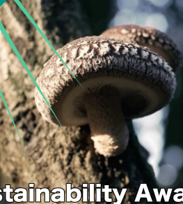
Forest-grown Shiitake in Takachiho, Japan